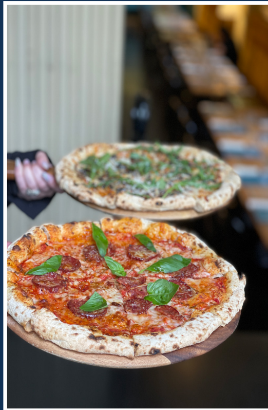
Artisan Pizza platters ($10pp, min. 30 pax) unlimited margherita, salami or fungi selection of hand stretched pizzas served for 1 hour during your event