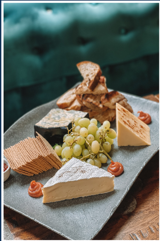
Victorian Cheese $150 regional pick blue, brie, manchego, apple & date chutney, grapes, lavosh, grilled sourdough