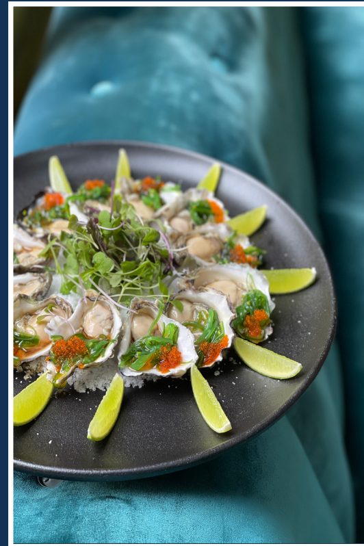
Pacific Oysters $60 Dozen tobiko, ponzo, wakame, lime